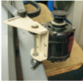
old style not compatible