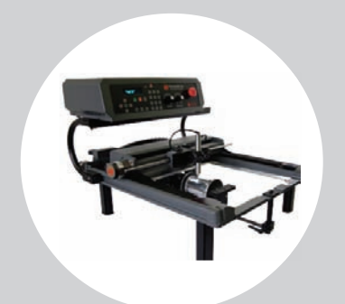
Solution Vise Attachment