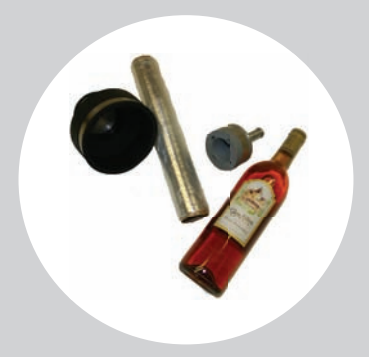
Wine Bottle Boot Kit