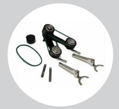
Dual Rotary Drive Kit